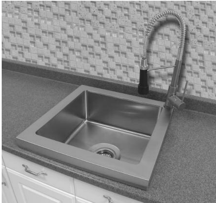
Above Shown with Single Hole Faucet Punch Modification (TA-472RE)