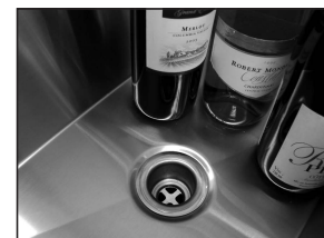
Includes 2-1/2" drain for easy water drainage

P rofessional Stainless Steel Products For Your Home