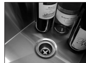
Includes 2-1/2" drain for easy water drainage