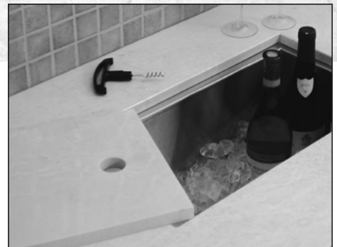
Shown with a reveal mount to accommodate a matching surface material sink cover (By others)