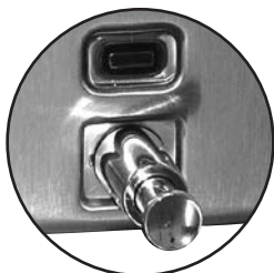
Push button soap dispensing activator