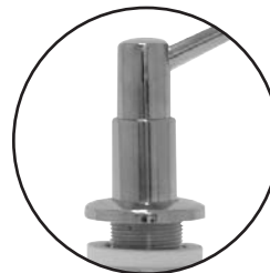
Hand pump soap dispensing activator