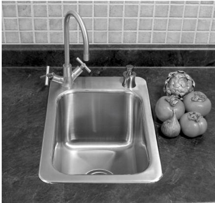
Above Shown with 2 Hole Faucet Modification (TA-472RE)