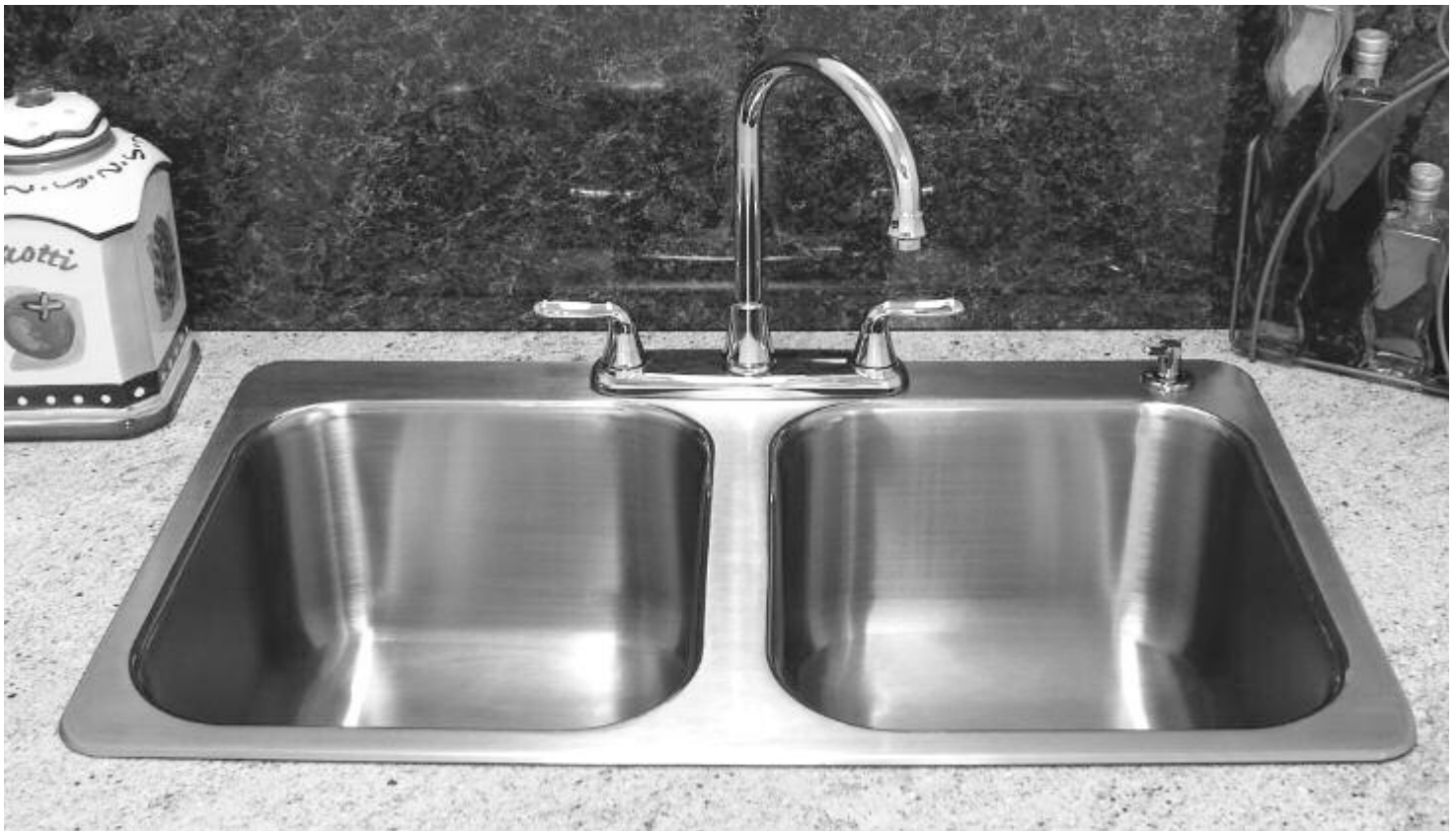
Above Shown with 4 Hole Faucet Modification (TA-472RE)